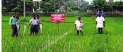
சுதநூரில் நடைபெற்ற செயல் விளக்கப் பயிற்சி.

விவசாயிகளுக்கு செயல் விளக்கப் பயிற்சி விவசாயிகளுக்கு செயல் விளக்கப் பயிற்சி விவசாயிகளுக்கு செயல் விளக்கப் பயிற்சி